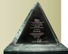
2002 - SBA Accountant Advocate of the Year