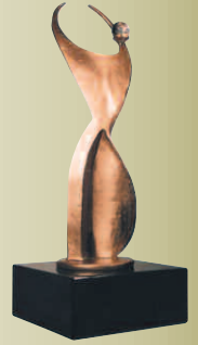
2004 - Athena Award Recipient

Cleveland, Ohio U.S.A. www.sa-consultinggroup.com info@sa-consultinggroup.com Phone: 216-593-0050 ▪ Fax: 216-593-0053