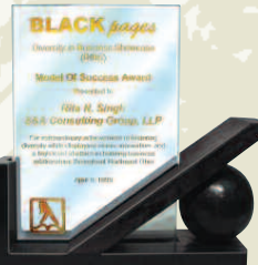
Diversity in Business Showcase Model of Success Award